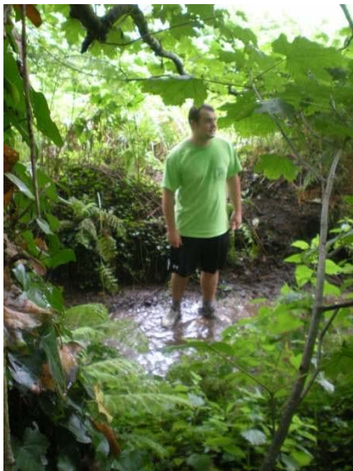
Desperado looks for a victim

Into a potato field we go & this provokes discussion as to why the plants appear to have been cut down. The consensus is that these spuds are for seed. This does not delay us for long & we enter some woods & descend to a stream. Desperado is in his element once more & distributes water liberally. Top Gun eventually decides to