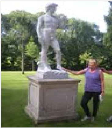
Admiration or Hope?