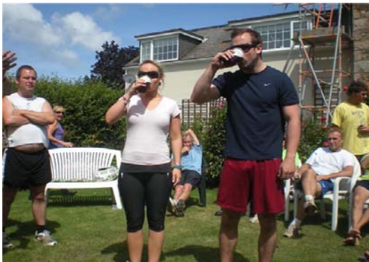
What a welcome

Our brother & sister Virgins are welcomed in traditional manner.