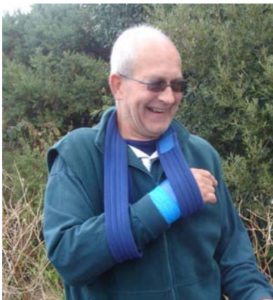
I'd prefer a gin sling

won't. "You're just a bunch of old crocks," was Wet Patch's sympathetic rejoinder. But despite the casualty list it was a very decent day for early October and