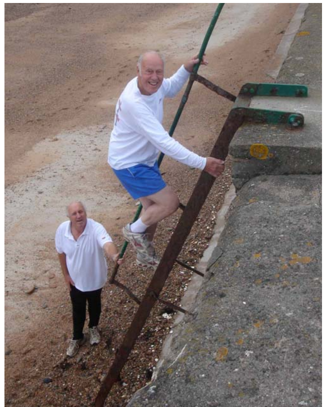
It's about time you put your foot down