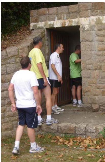
There's no light at the end of the tunnel

It led down to a steep set of concrete steps which seemed to go for ever – we were running (or more precisely, stepping ever so cautiously) under the dam itself. Encased in concrete, the echo was quite phenomenal as Rampant Rabbit proved to good effect. After a short flat stretch we found ourselves