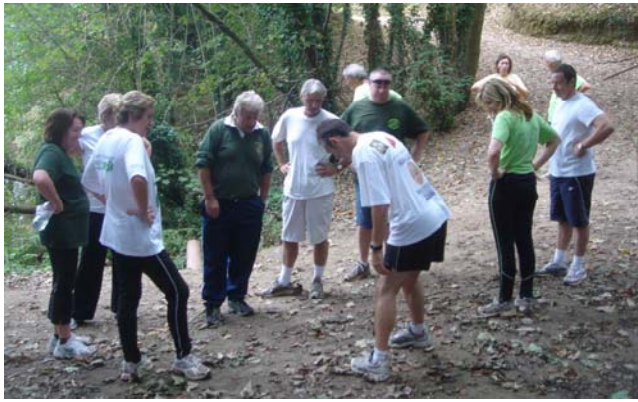
I'm sure it's sawdust