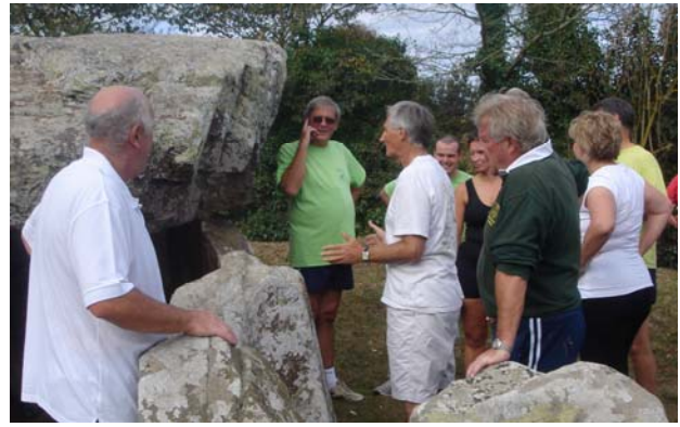
It took a hard drive to get them here