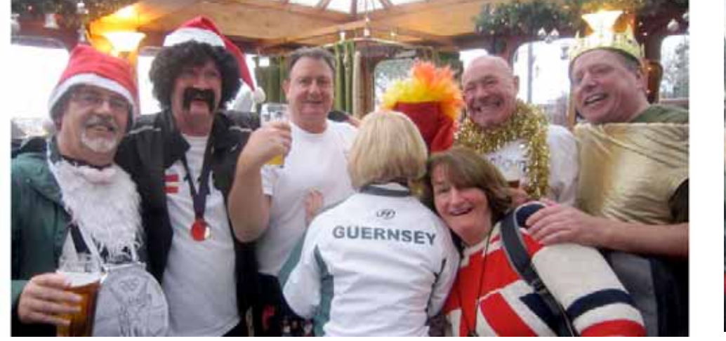
Guernsey turns its back on us - again!

all," said Pussy. "Haven't you read Law 21, sub-section 19 on Page 16 of the 'Articles of Hashing' which stipulates that enforced purchase of rounds when passing a pub in active service are suspended on the Christmas run." Hmm, it must be Christmas, we thought. We ran up the hill via that narrow footpath the leads up to Le Petit Felard only to find a double arrows and 'eight back'.