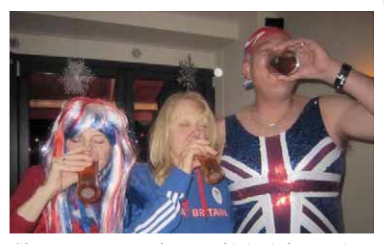
Close your eyes and pretend it isn't happening