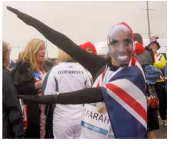
Just a mo