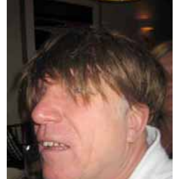
Toupée or not to pay for a hair-piece?

there was a distinct reluctance to get back into our stride but luckily we weren't quite legless yet. For a while the trail took us on the route of the previous week's run before running through the grounds of Mon Plaisir and on to the track that leads back to St Aubin. Muddy puddles there were aplenty, but no-one wanted their festive apparel to be contaminated with shiggy. We ran through the streets of St Aubin, passing the Trafalgar. Again we were