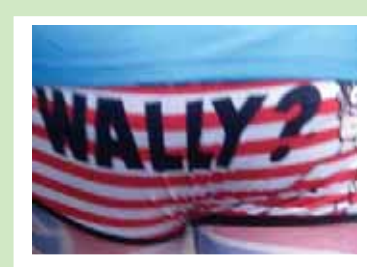
Say no more

on her face and holding up a great big Xmas tree. The angel said cheerfully: "Merry Christmas Santa. Isn't this a lovely day? I have a beautiful tree for you. Where would you like me to put it?" And thus began the tradition of the angel on top of the Christmas tree. Not many people know this.