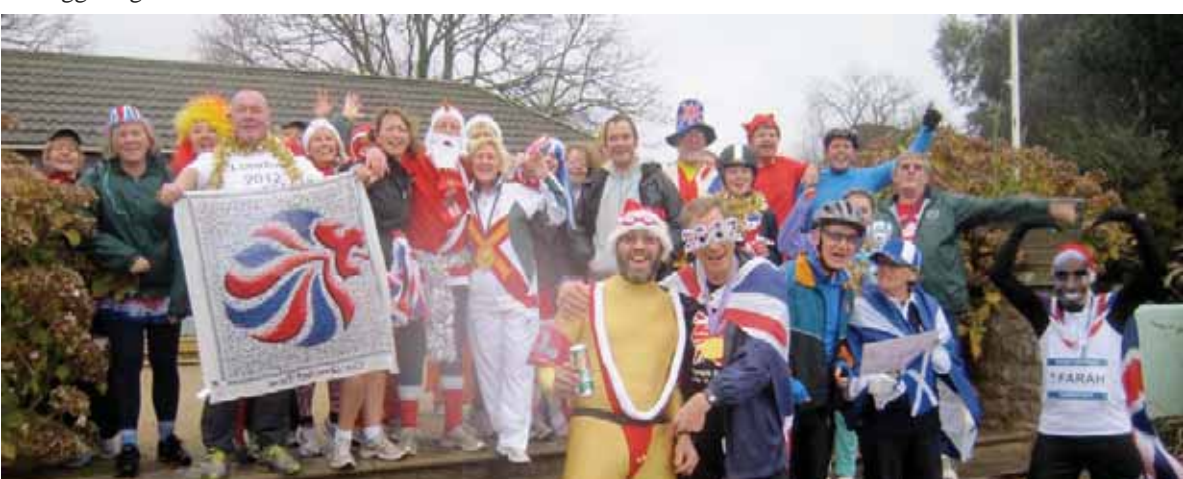
On on your marks

prove to be a serious rival in the future. However another runner who likes to go all the