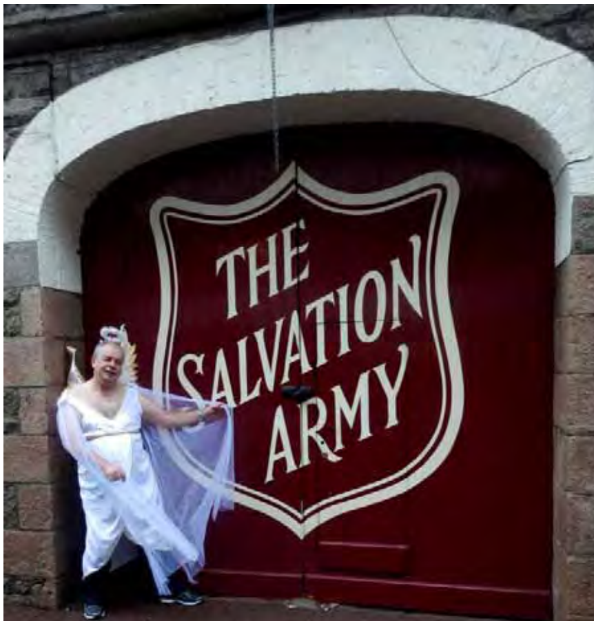
Tinky Winky's angelic mission to save the World