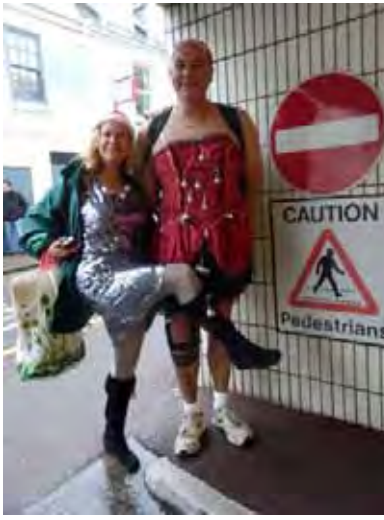
Beware the hares