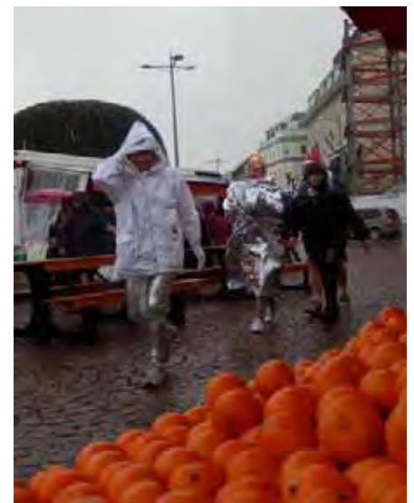
La Route Orange?