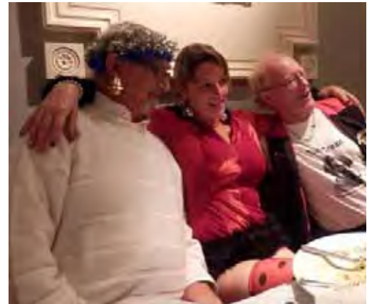
Eyes on the thighs?