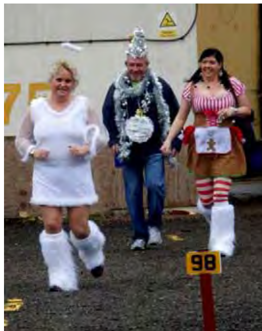
Fancy dress competition – 98 th place