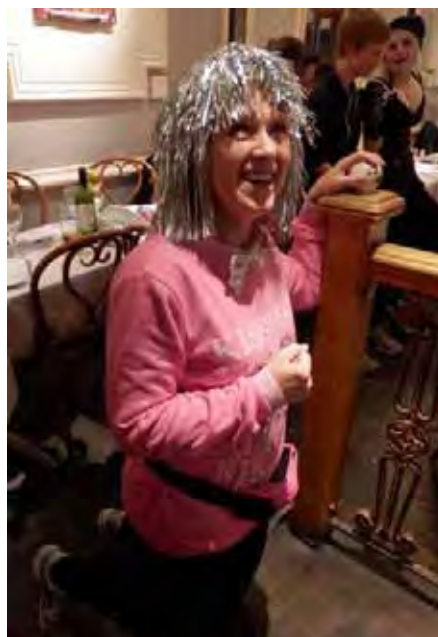
Knees-up or knees-down?