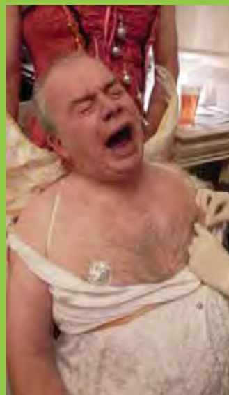
Moved to tears