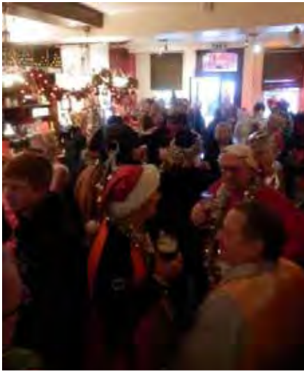
Bridging the gap

wake as we ran alongside the old abattoir building and into Liberation Square where Chrissie tried to take shelter under the flag held aloft by a group of brassed off-looking locals. Luckily shelter was at hand. We traipsed through the Christmas market in the Weighbridge with our sights firmly fixed on our place of refuge, The Ha'Penny Bridge where mince pies were on offer as well as the customary fare. As the drinks were quaffed the rain started coming down in torrents and the hares gave us the choice of braving the downpour or staying on for a second round. Some brave souls made it to the Dog and Sausage, or as Molehills remembers it, the Devon and Somerset, where we came across several more of our party including Throbbing Banger and IsitB. Rampant Rabbit was especially pleased to see the former: "How nice of you to pop out," he said. The hares decided to curtail the run at this point rather than endure any further soaking so