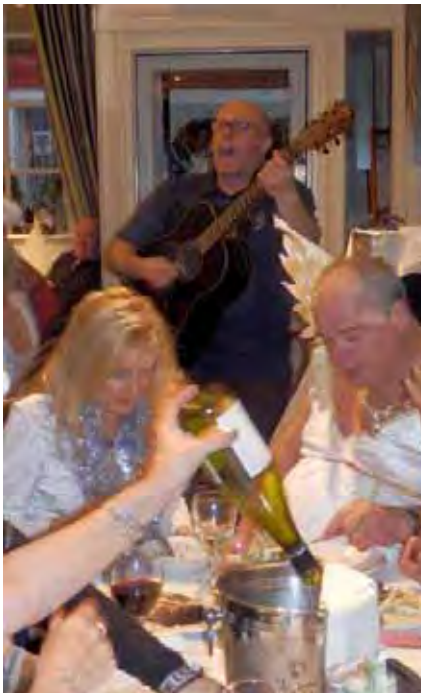
Shiggy strings us along