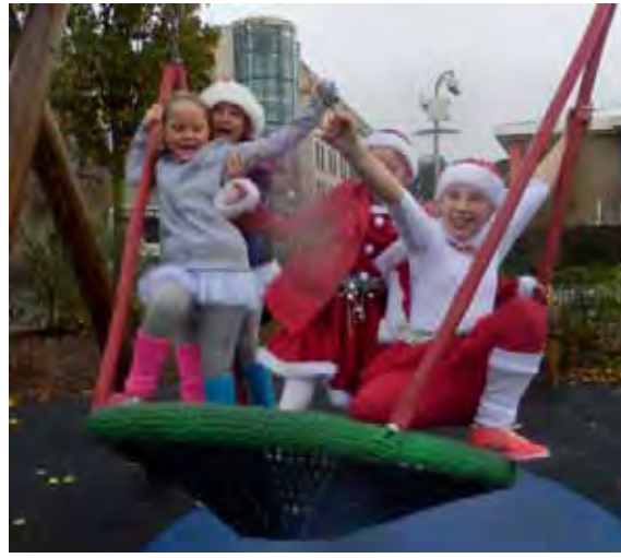
Flying saucer crew?