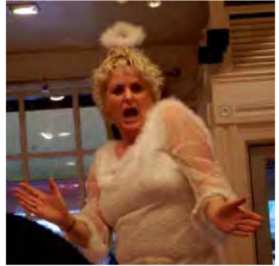
Voice of an angel?

it was a fairly easy run-in to our destination, the Lido, just outside the Market. The awful weather was soon forgotten as we tucked into an excellent meal, the venue proving to be a big hit. Eventually we got round to the afters. First the GM proposed the toast to absent hashers then on a more sombre note revealed that a fellow Crapaud was seriously ill in hospital. Tinky said it would nice if we could convey that our thoughts were with Cooperman. Ragsby volunteered to pass them on. After that things went rapidly downhill. Shiggy proposed that we give the GM a special treat in recognition of his diligent service to the hash during the year. "The only problem," said Shiggy, "is that he's a bit hairy. But luckily we have some volunteers who can help Tinky." The particular follicle challenge he was referring to was the GM's chest hair. Suddenly there was the awful sound of strips being applied to Tinky's torso and then torn off amid much