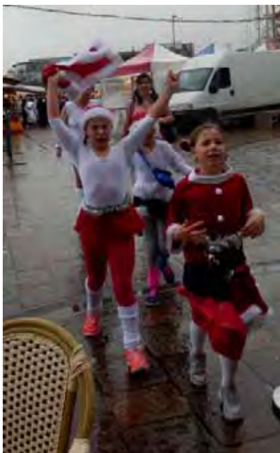
Hooray – a drinks stop