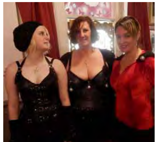
Lots of happy mammories