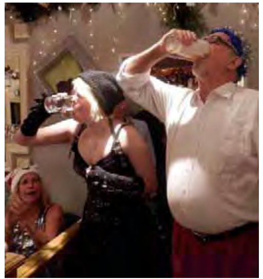
Waist not, want not