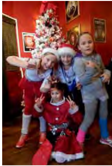
In a class of their own?

wake as we ran alongside the old abattoir building and into Liberation Square where Chrissie tried to take shelter under the flag held aloft by a group of brassed off-looking locals. Luckily shelter was at hand. We traipsed through the Christmas market in the Weighbridge with our sights firmly fixed on our place of refuge, The Ha'Penny Bridge where mince pies were on offer as well as the customary fare. As the drinks were quaffed the rain started coming down in torrents and the hares gave us the choice of braving the downpour or staying on for a second round. Some brave souls made it to the Dog and Sausage, or as Molehills remembers it, the Devon and Somerset, where we came across several more of our party including Throbbing Banger and IsitB. Rampant Rabbit was especially pleased to see the former: "How nice of you to pop out," he said. The hares decided to curtail the run at this point rather than endure any further soaking so