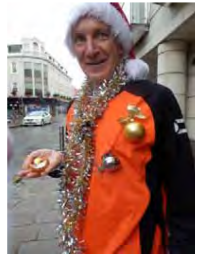
Bagsofit's broken bauble