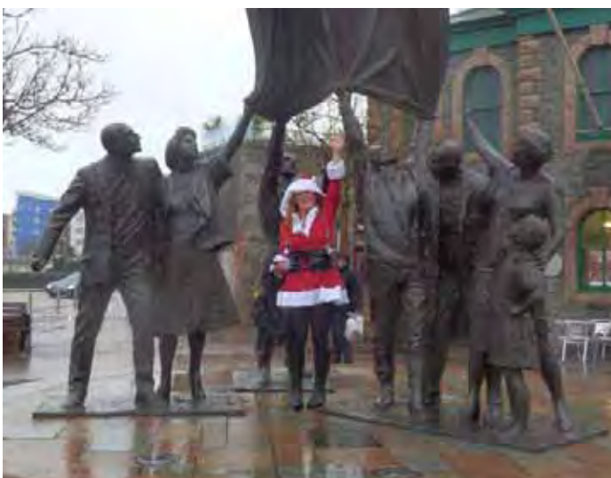
Their bloody umbrella is useless