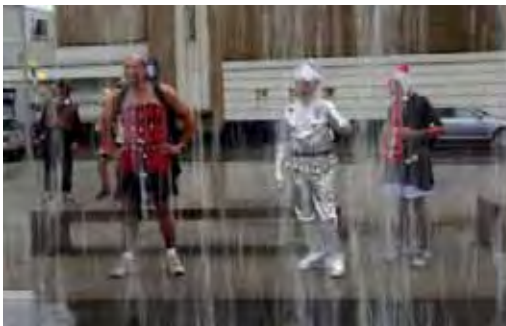
What a shower