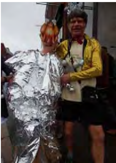
Taking a shine?

the swings and roundabouts – including that veteran hash swinger, Ballcock. But Christmas joy soon followed as the shower curtain opposite the Odeon building was working and we had a merry time running through it, getting wetter than we already were, if that were possible. The trail took us into the back streets of St Helier where our hares led us up the garden path or Garden Lane to be precise. Although Rampant Rabbit had another name for it, Dog Shit Alley. We found ourselves heading for People's Park and another playground, where the usual suspects again made the most of the facilities, before making for the sea front. Thoughts of a refuge from the rain in the shape of a watering hole were in the forefront of our minds – indeed Shiggy started to get quite excited, shouting "Sober, sober," presumably meaning his alcohol levels were dangerously low. But it turned out he was saying "So Bar" in the desperate hope that it would prove to be the first drinks stop. Fat chance. More bars were left in our