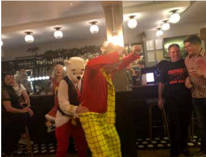
Follow my Wiggling Bear Bum!