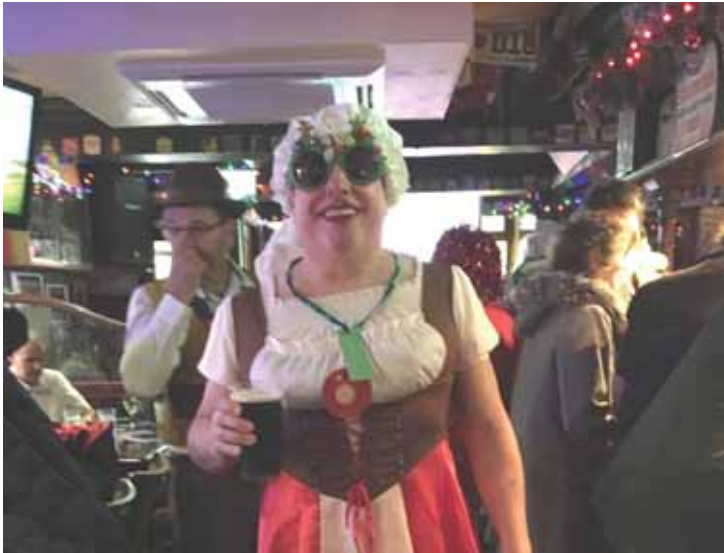
Blind & Crazy Bitch