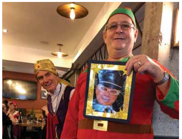
The Tinky Winky Cross-Over Award!