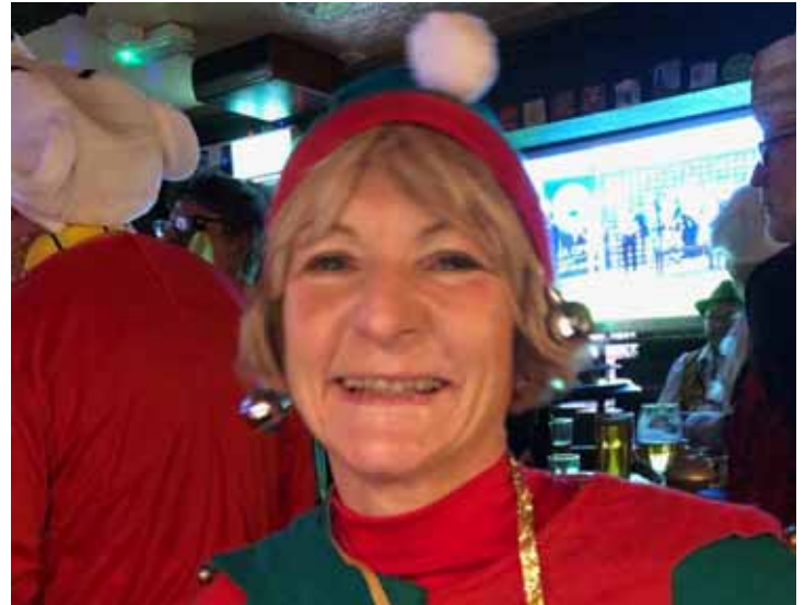
Spin me Around Again, Please!