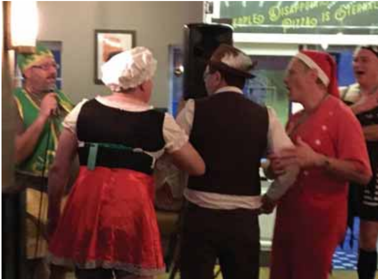
Undercover Cops Removing Suspect!