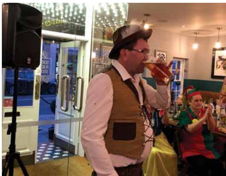
Red Baron Mobile Sinner!