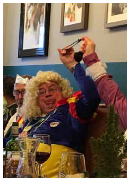
Grappling Pussy's Thong!