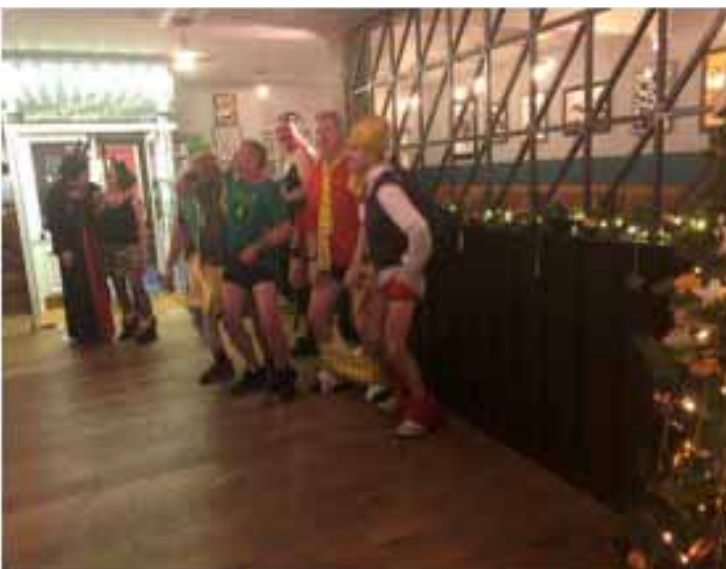
Chippendale's Warming Up for Stripping Orff!