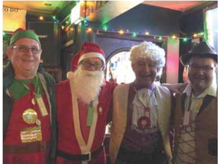
Four Likely Lads