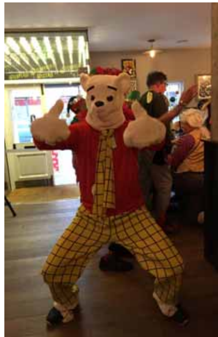
Bears Thumbs Up