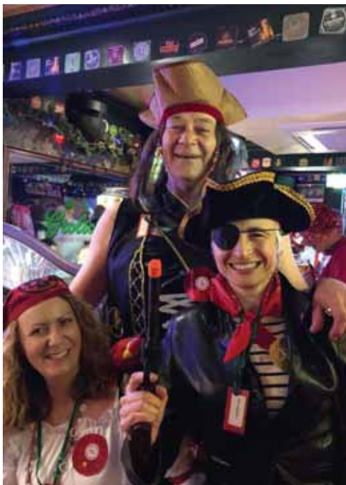
Hold Up Yer Hands!