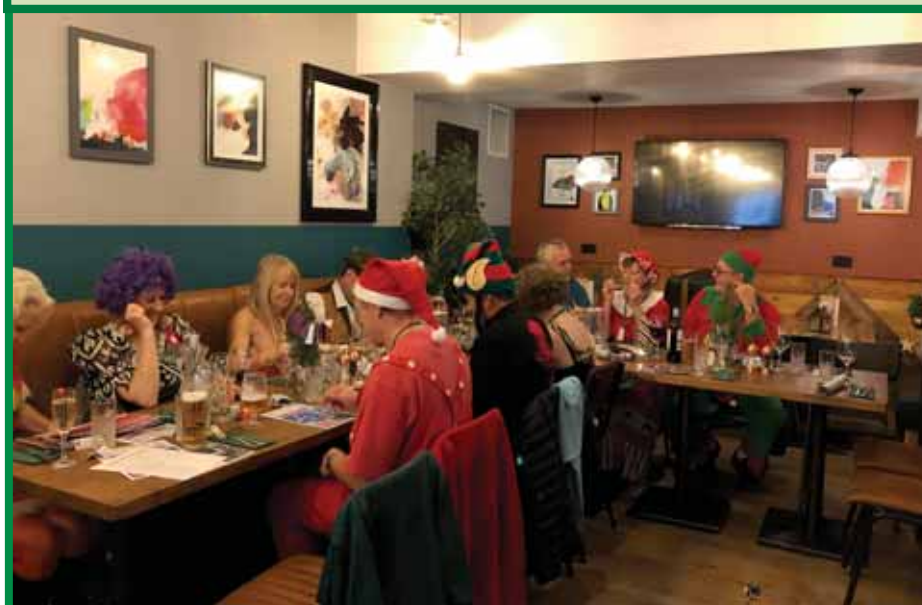
Pondering the Goings-On-On