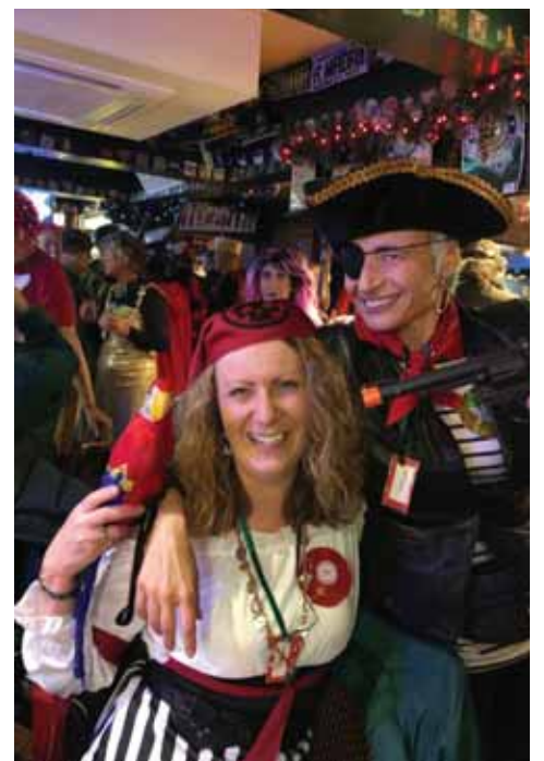
Shooting Bloody Parrot!