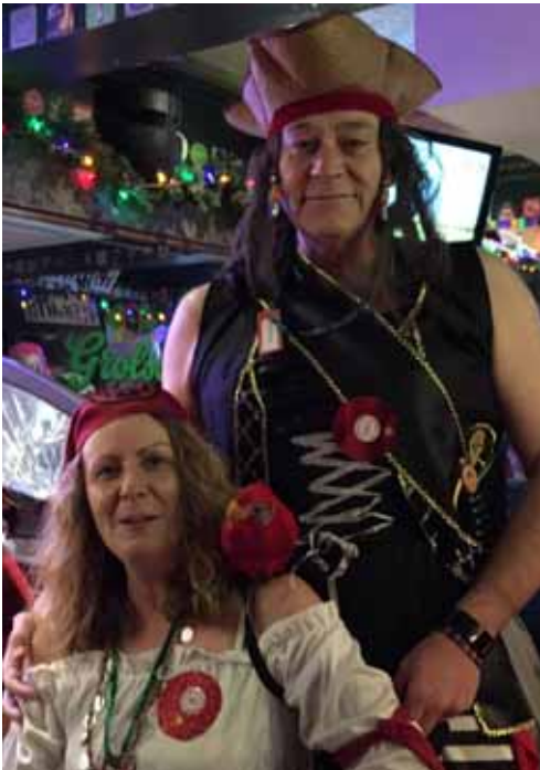
Ahoy me Hearties! & Bloody Parrot