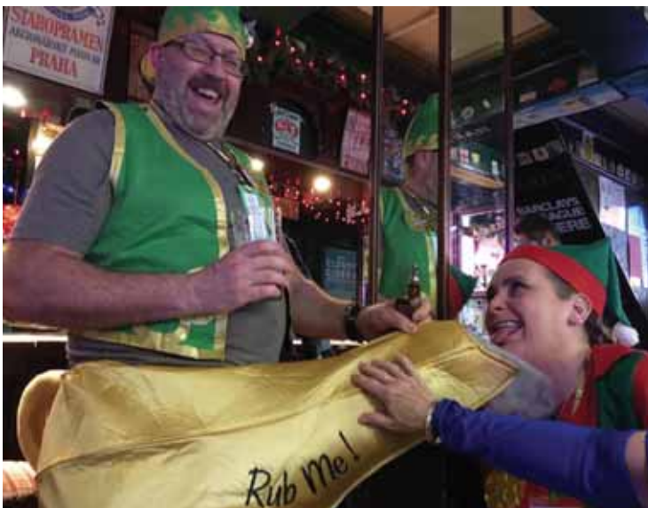
I said "Rub It, not Lick It!"