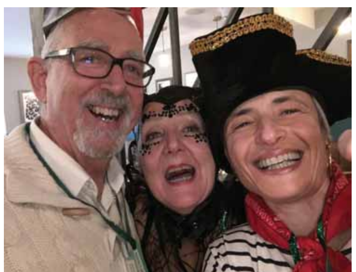
Philanderer, Devil & The Pirate still Smiling!