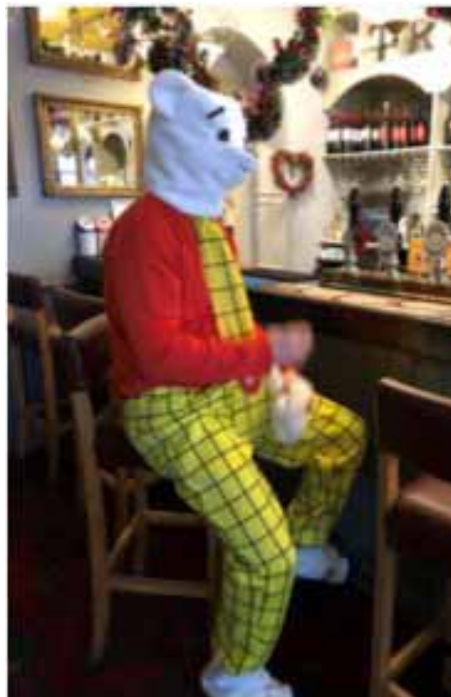
Whatever happened to Rupert?