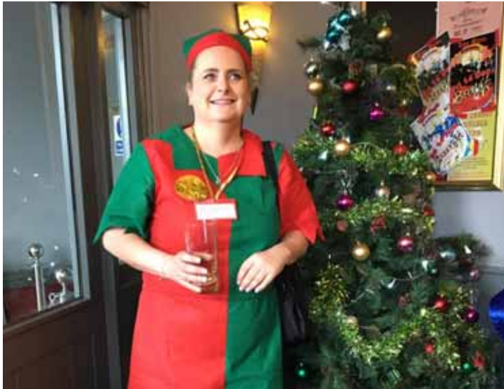
Not so Bright Lights