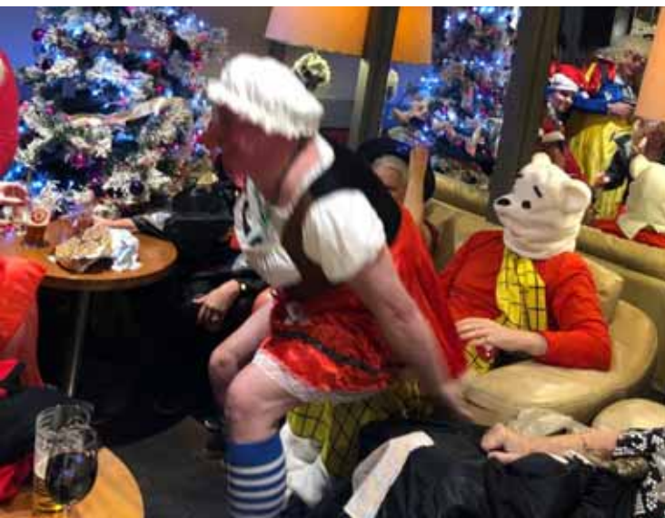
Humping the Bears Lap Game