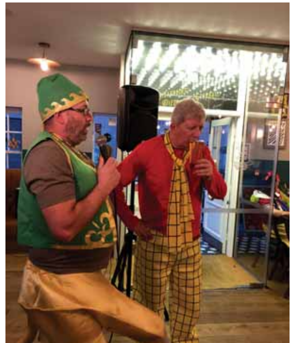
Big Bears Birthday!

Outgoing Grand-Master Tinky Winky , plus Hash Reverend Gigolo Finally , our two excellent Christmas Witches, sorry, Hares - Hooker and Pussy – Three Cheers!