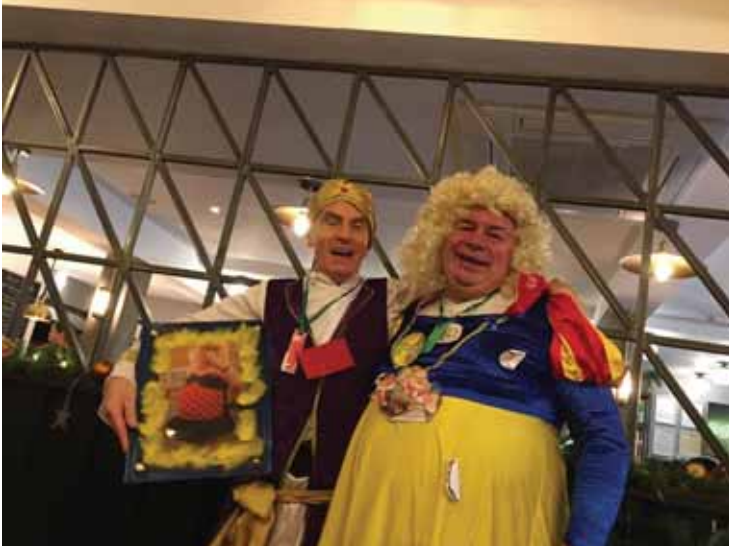
As Pretty Today as Twenty Years Ago!