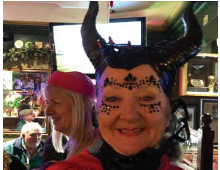
Better the Devil Hare you Know