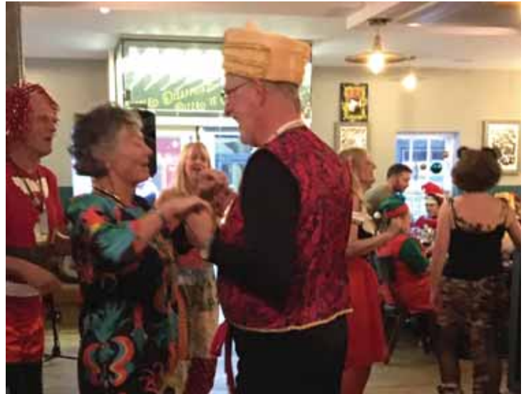
Doing the Tango!