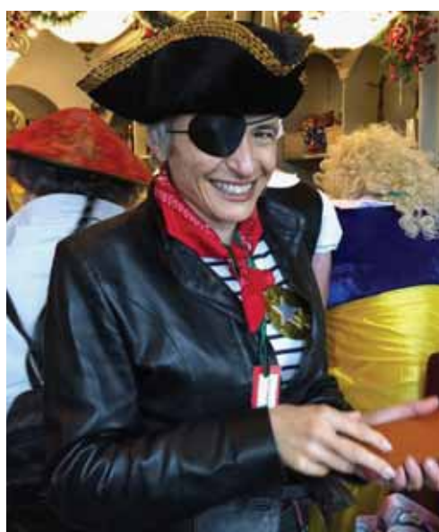
Under-cover Russian Spy?