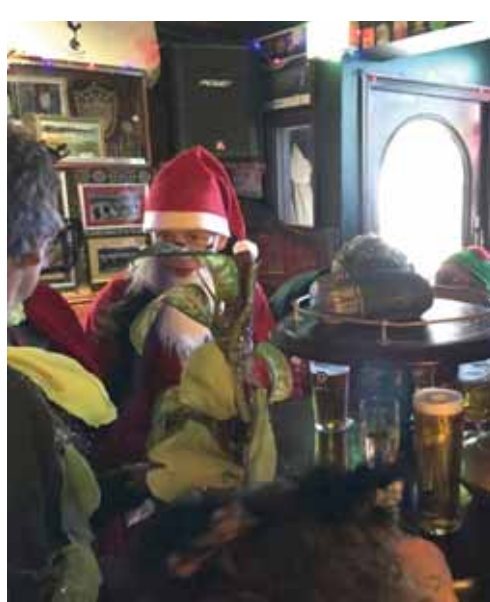
Who brought that Triffid Along?