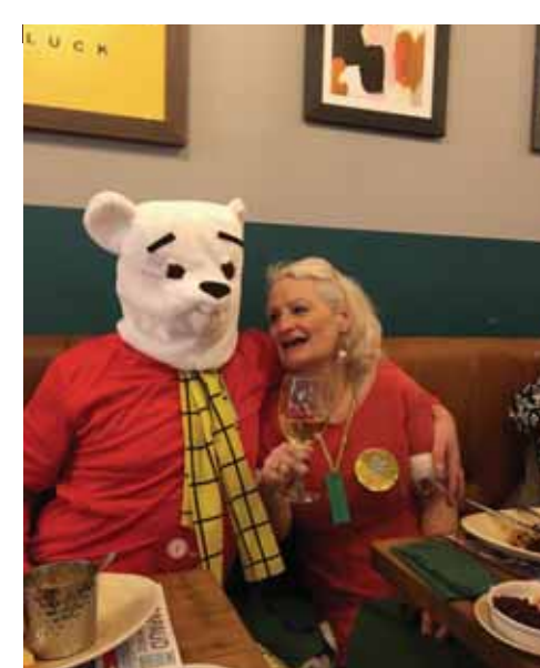
I LOVE my Bear Cuddles!