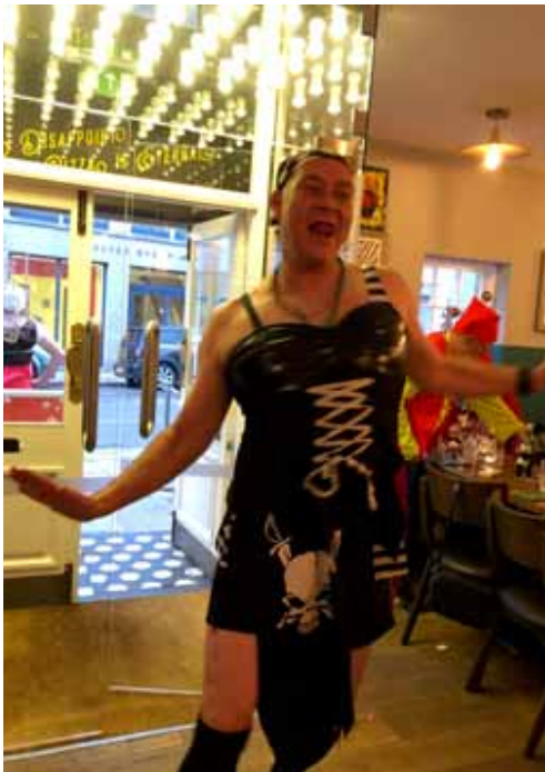
Smooch with Me!