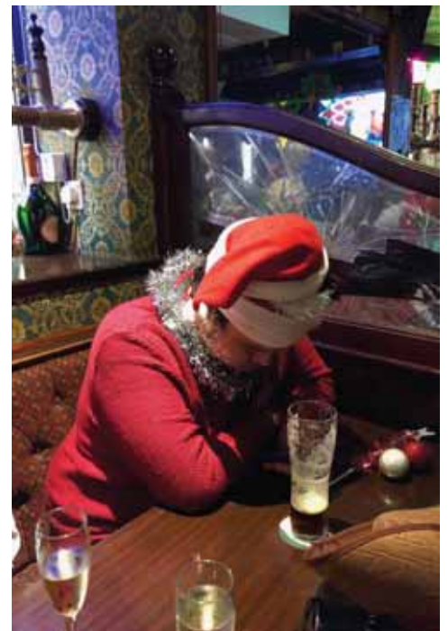
Really Out of It!