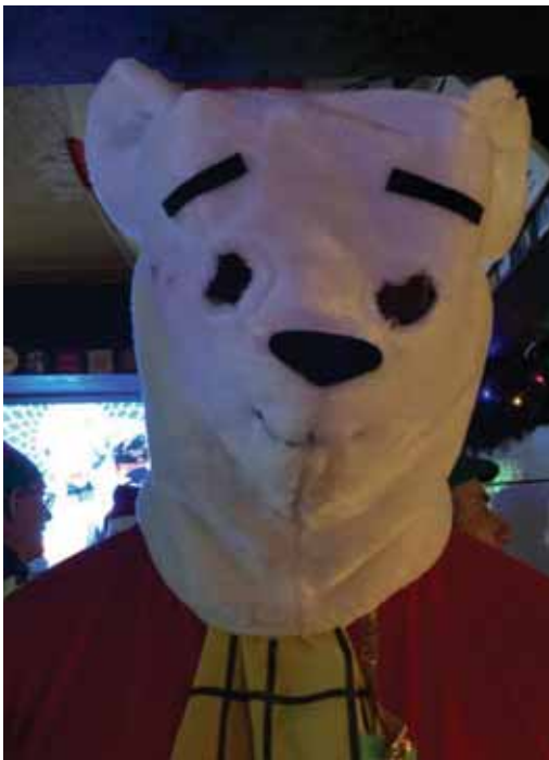
Head Banging Bear!