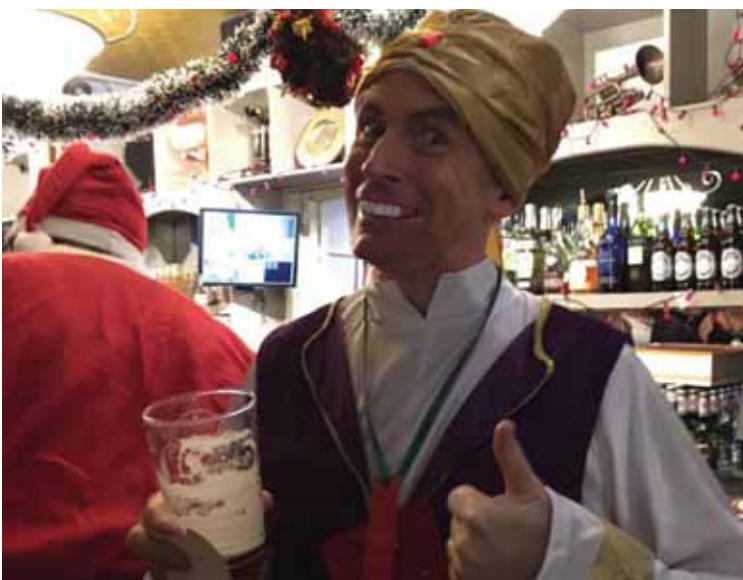
Who let Genie out the Bottle?