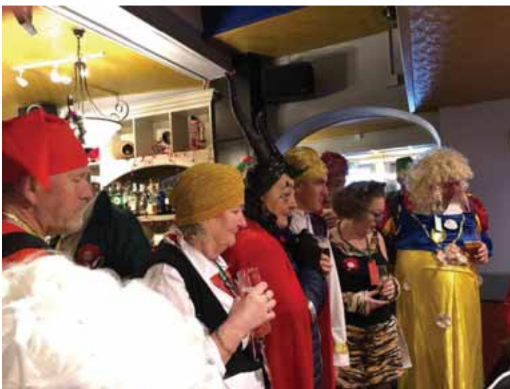
Watching Gigolo Fall on his Appendage!