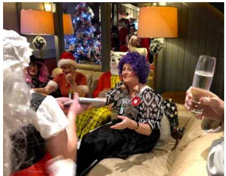
Pass the Parcel Game