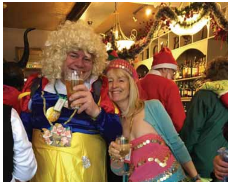
Large 'n' Little