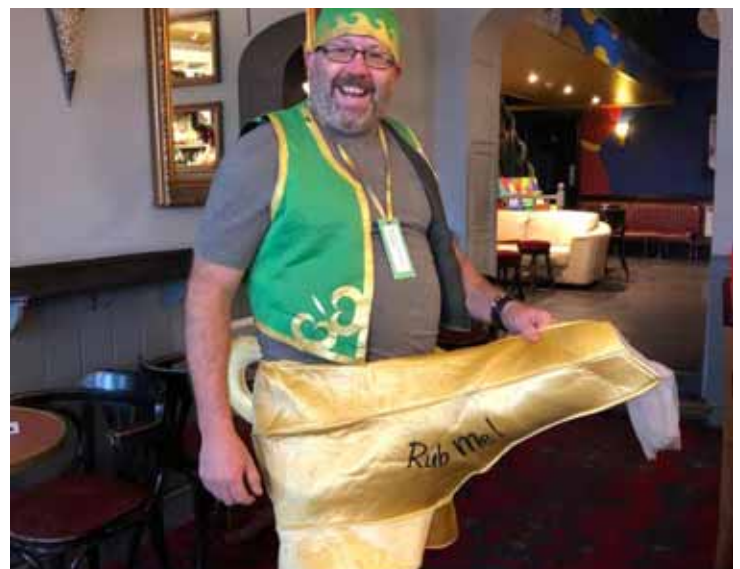
No-one Rubbed my Appendage!