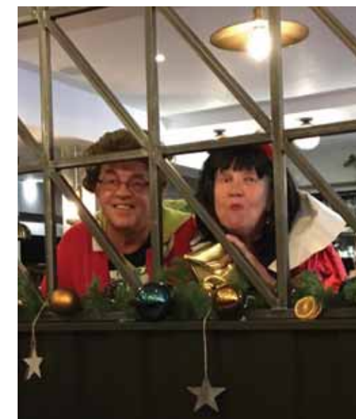
Barred from the Bar!