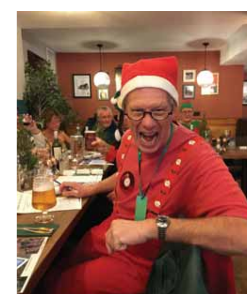
Growling Get off my Wife, Bear!