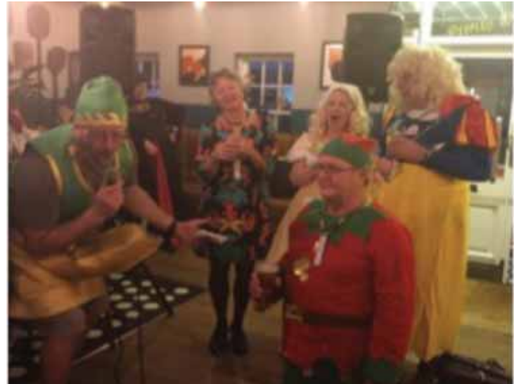
Molehills on Knees being Induced as RA