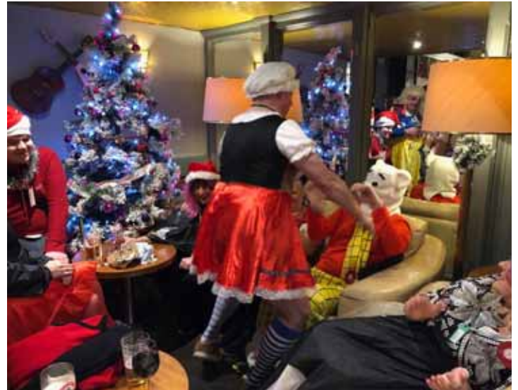
Going for the Bears Lap