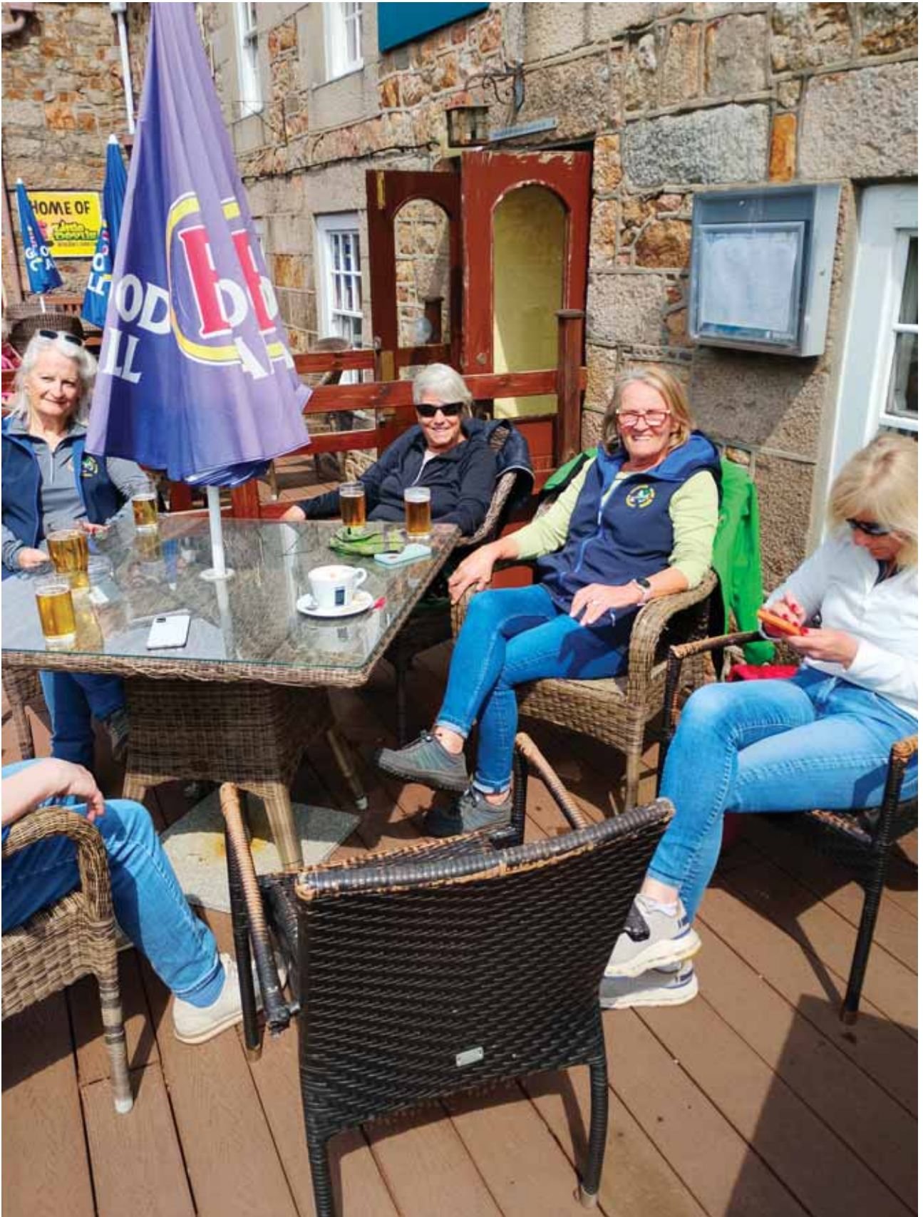
The sun arrived in the end