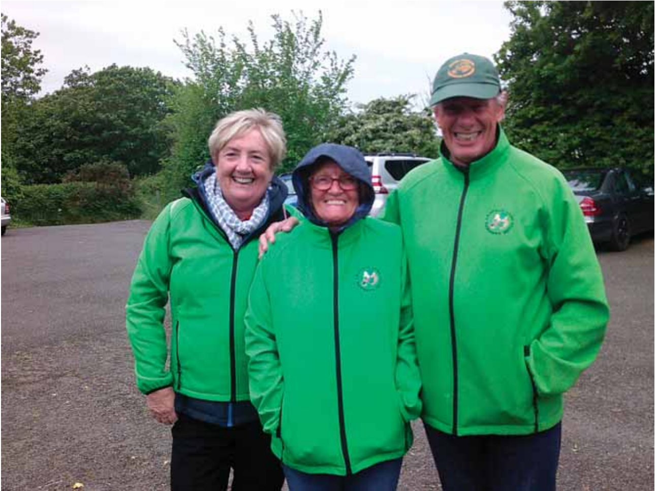
Les amis verts