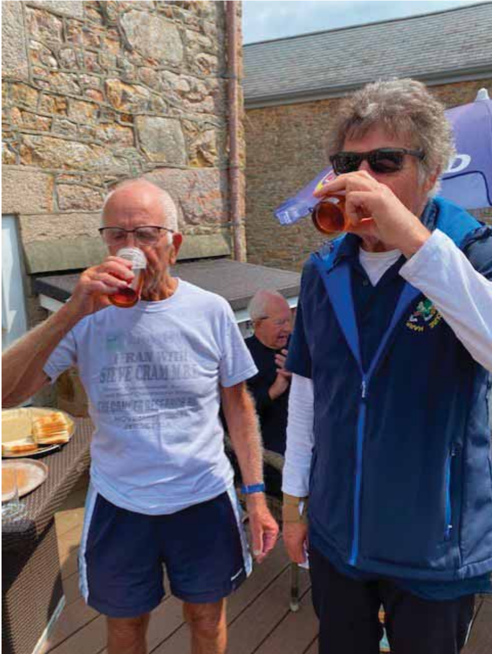
A sinner and the hare