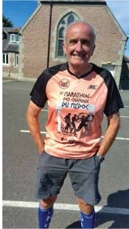
No wine on this run