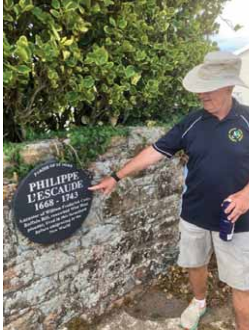
Buffalo Bill was here – or not.