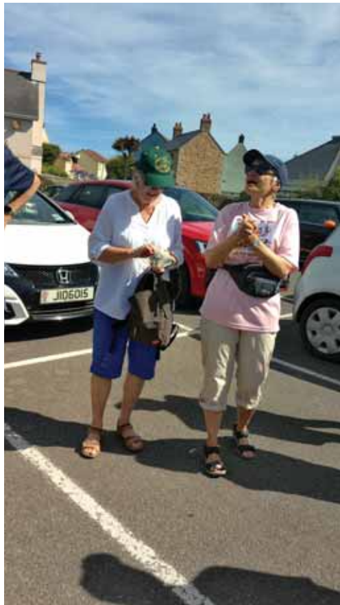
Temporary Hash Cash & Hare