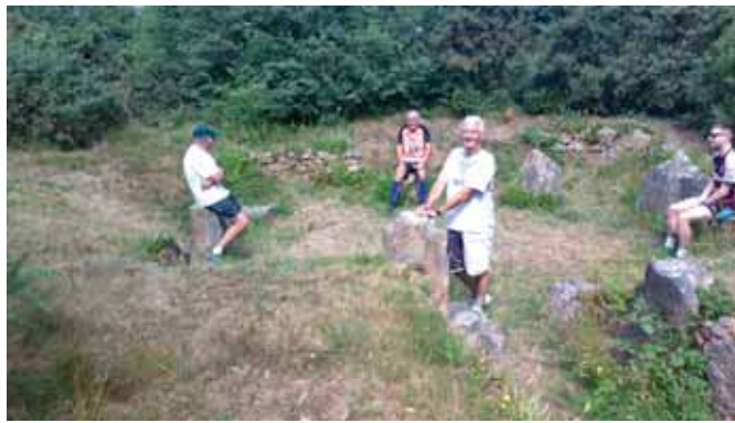
.....to the dolmen