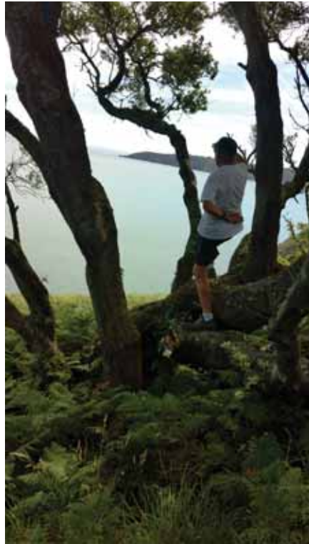
GM contemplating a swim?