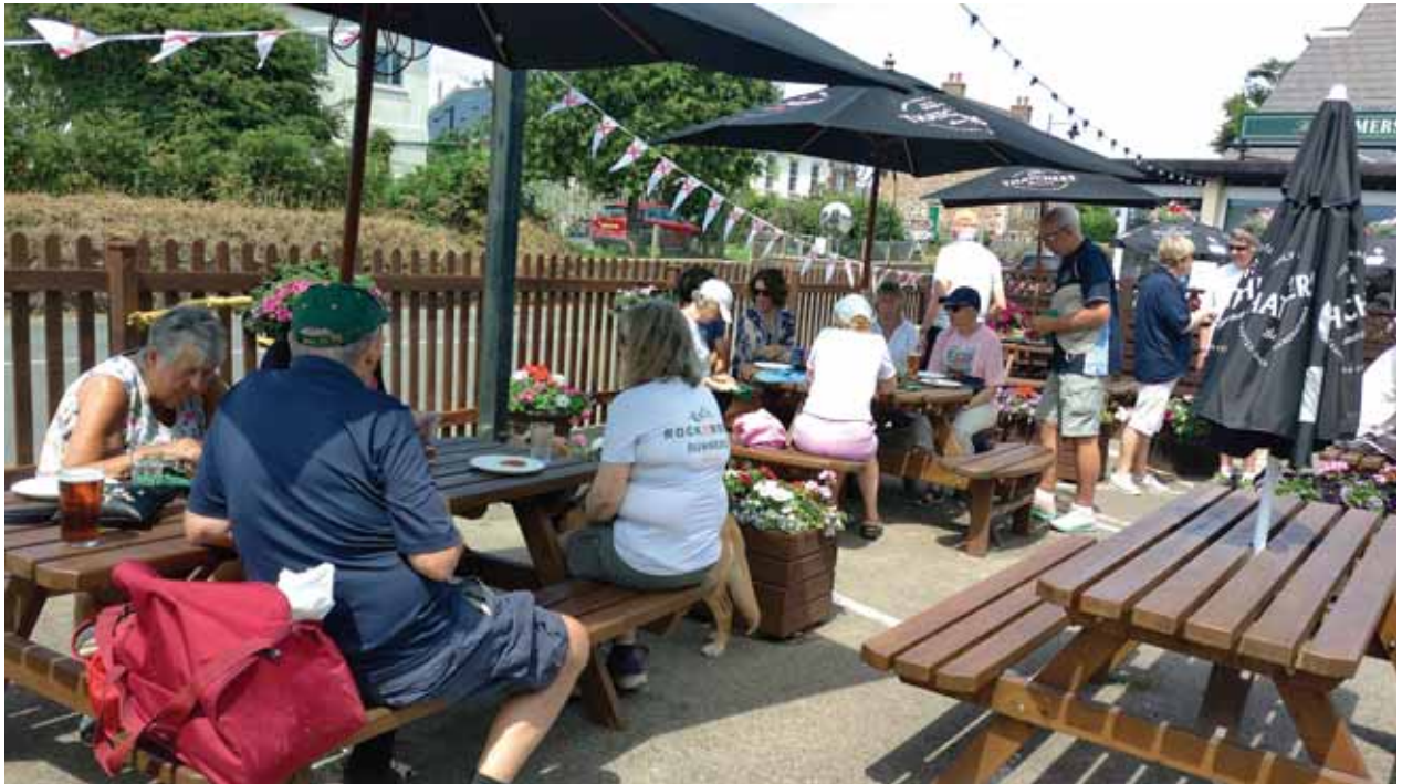
Shaded al fresco